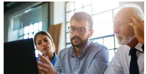
Crisis Response, Management, & Recovery